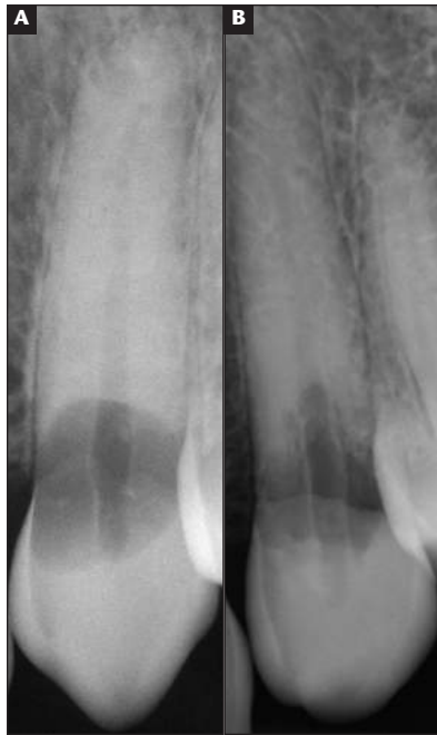
Figure 12A This very large external inflammatory resorption in the cervical area has a rather smooth peripheral outline. The outline of the root canal space can clearly be identified through the radiolucency of the resorptive lesion.