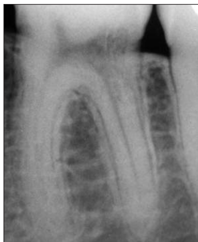
Figure 9A Extracanal invasive resorption in the distal of a mandibular molar. A radiograph taken 2 years prior to this radiograph showed no evidence of resorption.