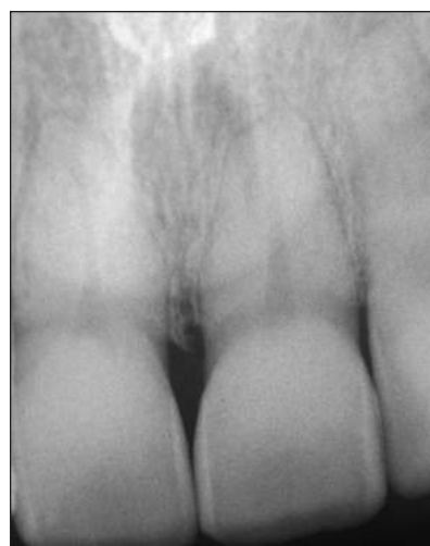
Figure 10B A radiograph taken 21 years after Figure 10A shows no evidence of resorption.