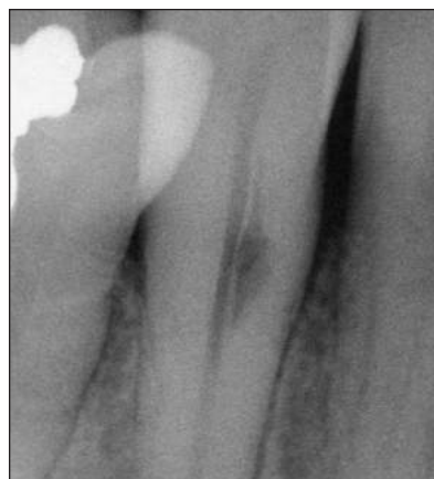
Figure 2B An extracanal invasive resorption can be identified lateral to but parallel with the canal space. No radiographic evidence can be identified of a resorption hole at the root surface or the resorbed pathway from the periphery to the main focus of resorption. Small radiolucent projections (“spider legs”) extend from the main focus of the resorption.