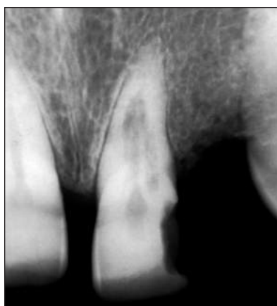
Figure 3A Radiograph of a maxillary central incisor with an extracanal invasive resorption lesion.