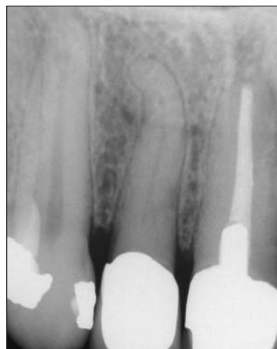
Figure 10D A radiograph taken 7 1/2 years later shows little evidence of the original resorption.

process is that the radiolucent lesion may appear to resolve (Figure 10A through Figure 10D). Commonly, there is radiographic evidence of a gradual decrease in the size of the resorption radiolucency over a number of years until there is an appearance of no remaining radiolucent lesion or only the suggestion of a small remnant. As this may be viewed as an unexpected result, the question may be raised as to how it could even occur. Clearly, the cellular elements in the resorptive tissue are not only capable of resorbing cementum and dentin but are also capable of laying down new calcified tissue within the area of resorption. In some cases, the tissue may lay down irregular segments of new calcified tissue within the resorption and result in a radiographic appearance suggestive of a trabecular pattern. In other circumstances, it may lay down new calcified tissue on the resorbed dentin surface, gradually reducing the size of the radiolucent area until it cannot be identified on radiographs. It is most likely that there is some soft tissue remnant but it would have to be of small caliber. Whether or not an extracanal invasive resorptive lesion which appears to have resolved may reverse the process with a recurrence of the resorption is unknown.