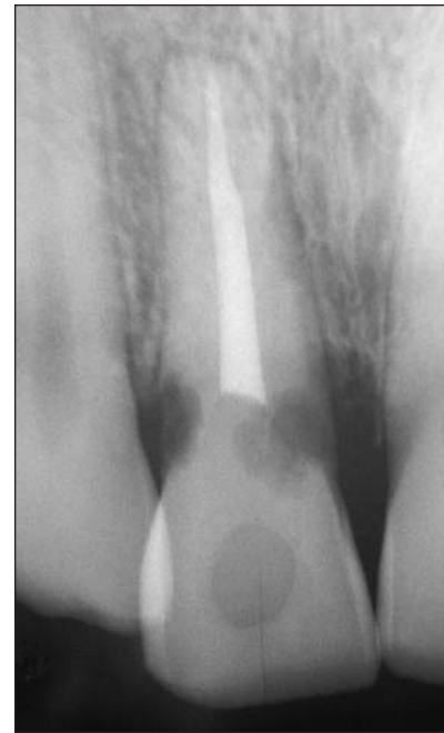
Figure 11 External resorption related to bleaching. Radiolucent lesions are evident on both the distal and the mesio-palatal surfaces in the cervical area of the root.

If the resorptive lesions related to bleaching, as well as other resorptive lesions more appropriately described as external resorption of an inflammatory origin, are separated from the types of lesions described in this article, then it can be stated that the prognosis for the clinical management of external inflammatory resorption is commonly quite good, while the prognosis for the