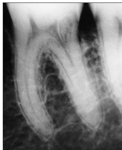
Figure 9B A radiograph taken 10 years after Figure 9A.