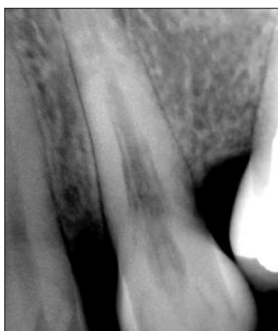
Figure 4 The extracanal invasive resorptive lesion in this maxillary cuspid has the radiographic appearance of radiolucent lines running parallel to the canal space on both the mesial and distal.