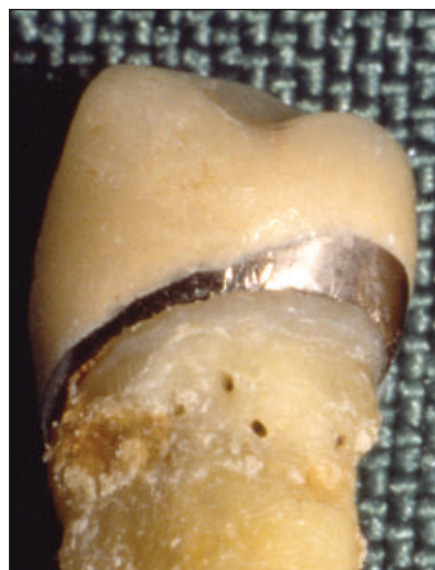
Figure 1B If the premolar is rotated, four resorption holes can be seen on the lingual and proximal surfaces.