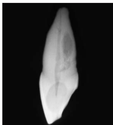
Figure 3B A proximal radiograph of the extracted tooth demonstrates a resorptive lesion palatal to the intact root canal. Figure 3A demonstrates that the coronal extent of the resorption is distal to the root canal.