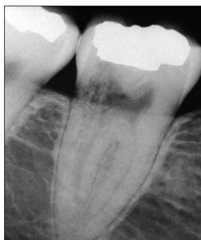
Figure 5 The extracanal invasive resorption in this mandibular molar has a mottled appearance.

or both. The resorbed area within the body of the dentin must commonly be quite advanced before it can be recognized on radiographs (Figure 2A and Figure 2B). At this stage in the development of extracanal invasive resorption, the lesion commonly has minute radiolucent projections extending from the main focus of the resorption (Figure 2B). These projections may have the appearance of small “spider legs.” Extracanal invasive resorption, therefore, can first be recognized when the resorption has developed sufficiently within the body of dentin between the root canal and the external surface of the tooth. During this phase, there is seldom a communication with the root canal space or the pulp chamber (Figure 3A and Figure 3B). The resorption tends to extend within the body of the dentin around the canal space. The radiolucency of the resorption often appears to parallel the canal space (Figure 4).