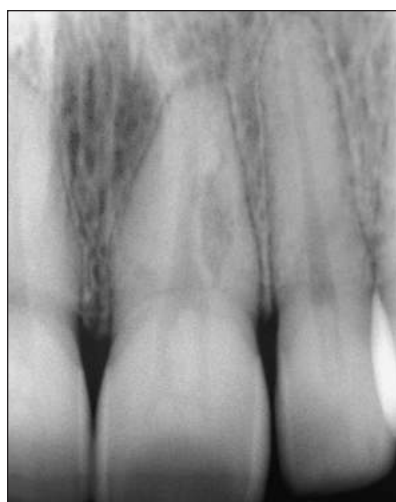
Figure 10A Extracanal invasive resorption in the root of a maxillary central incisor. "Spider legs" can be identified.