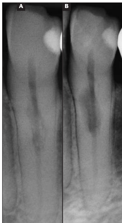
Figure 6A Extracanal invasive resorption can be identified in the radiograph of this mandibular cuspid. A previous radiograph demonstrated little or no change in the radiographic appearance over a period of 5 years.