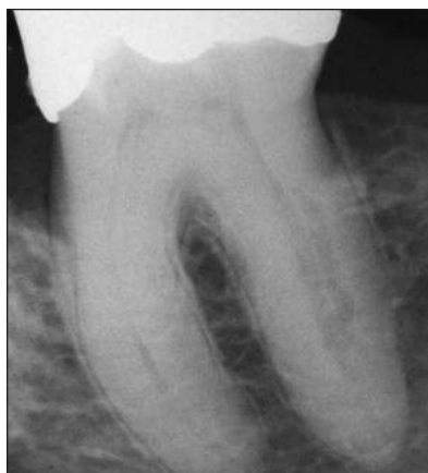
Figure 2A An extracanal invasive resorption can be identified distal to the canal space in the distal root of this mandibular molar.