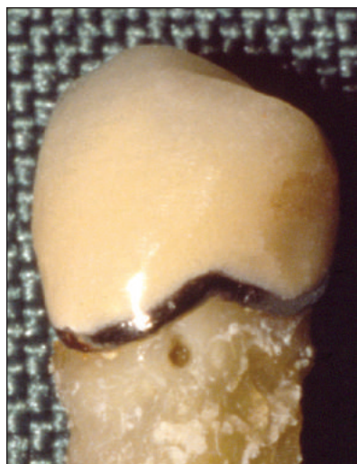
Figure 1A A small resorption hole can be identified at the attachment level at the buccal line angle of this mandibular premolar.

Department of Endodontics University of Washington School of Dentistry Seattle, Washington