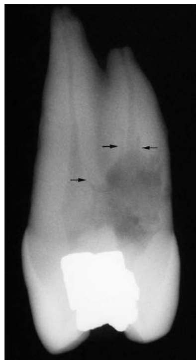
Figure 7 A proximal radiograph of this extracted tooth demonstrates a very large resorptive lesion that has resorbed a large part of the wall of the pulp chamber and palatal root canal. "Spider legs" are marked by arrows. The root of the extracted tooth appeared to be intact. A small resorption hole could be identified on the palatal surface of the root.