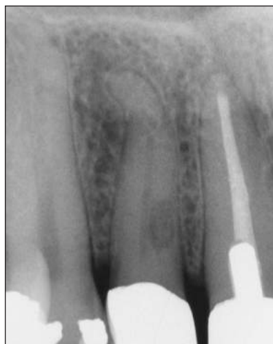
Figure 10C Extracanal invasive resorption in a maxillary lateral incisor.